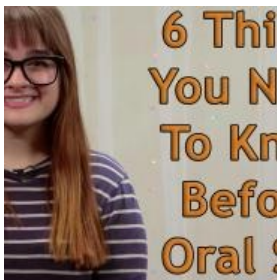
6 Things You Need to Know Before Oral Sex