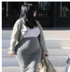
FDA Warns Kim Kardashian About Instagram Endorsement