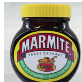
Foods banned around the globe Partner Content